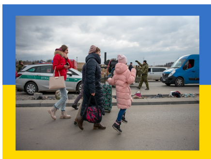
Preparing to leave